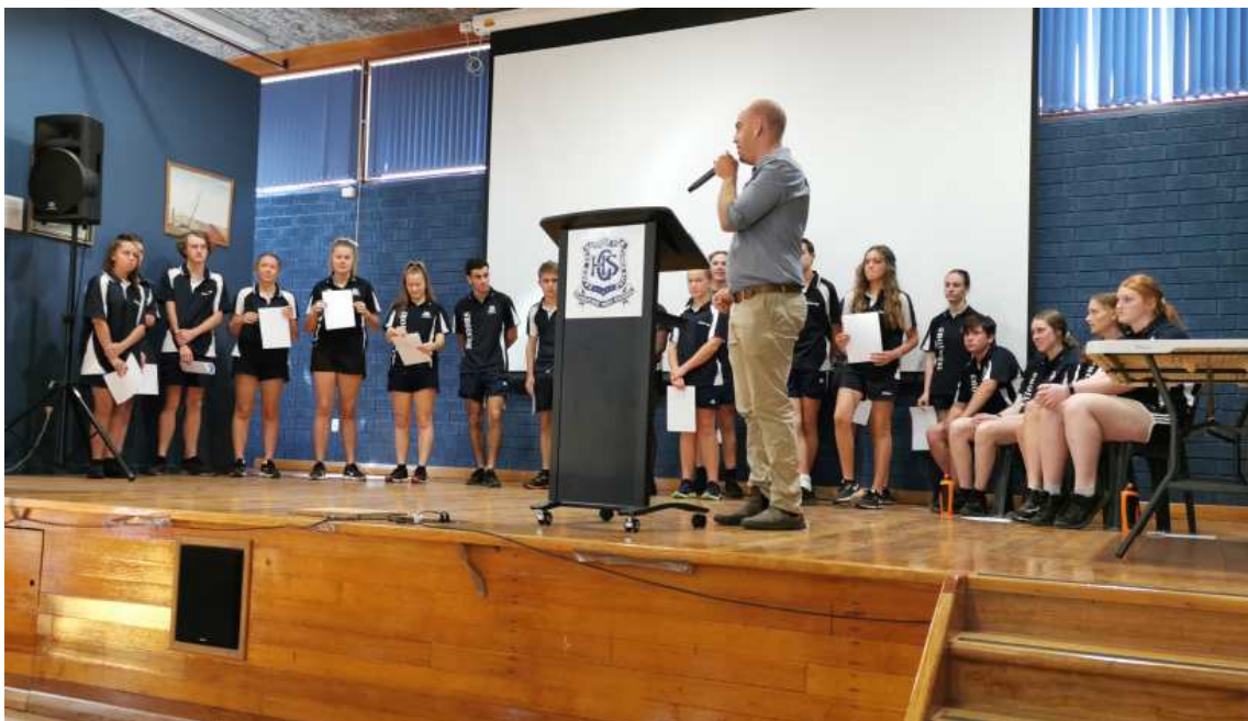
School Leaders and House Captains for 2020.