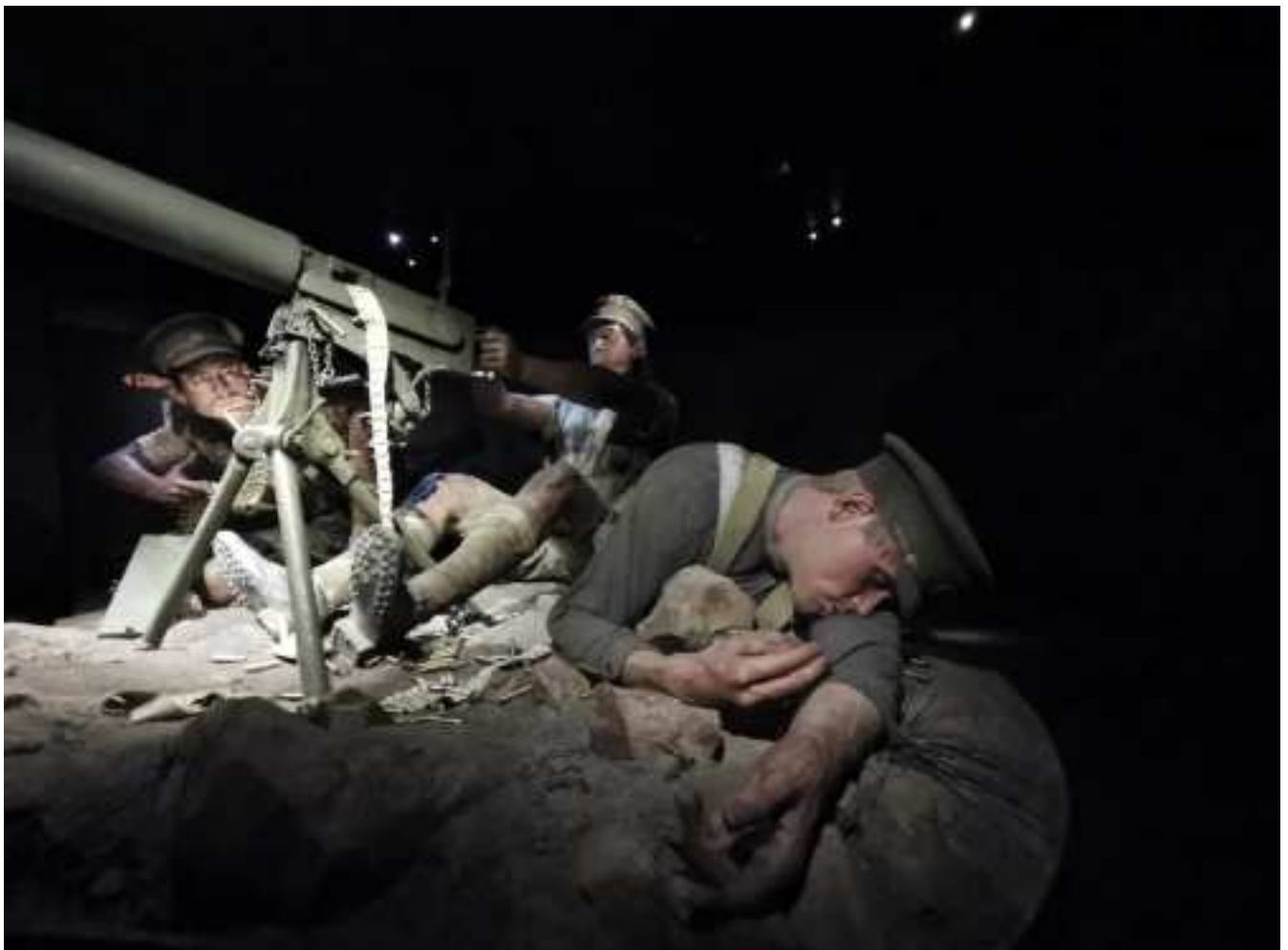
Photos taken at Wellington Museum New Zealand